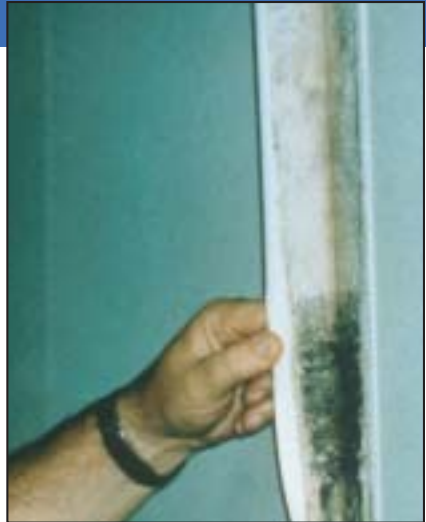
Mold growing on the back side of wallpaper.

Suspicion of hidden mold You may suspect hidden mold if a building smells moldy, but you cannot see the source, or if you know there has been water damage and residents are reporting health problems. Mold may be hidden in places such as the back side of dry wall, wallpaper, or paneling, the top side of ceiling tiles, the underside of carpets and pads, etc. Other possible locations of hidden mold include areas inside walls around pipes (with leaking or condensing pipes), the surface of walls behind furniture (where condensation forms), inside ductwork, and in roof materials above ceiling tiles (due to roof leaks or insufficient insulation).