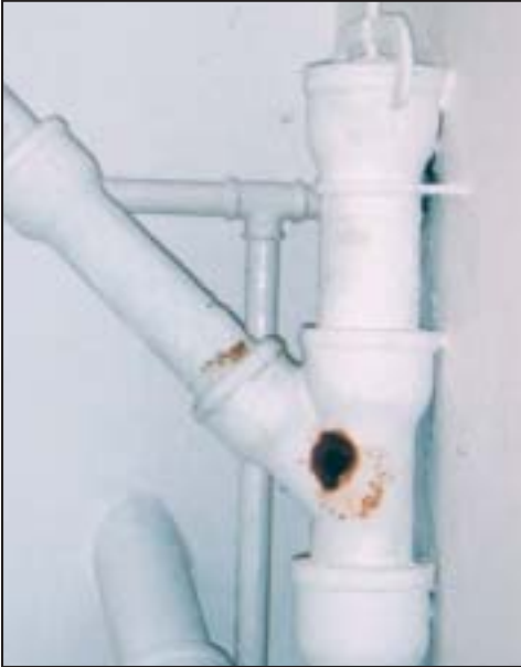
Rust is an indicator that condensation occurs on this drainpipe. The pipe should be insulated to prevent condensation.

Renters: Report all plumbing leaks and moisture problems immediately to your building owner, manager, or superintendent. In cases where persistent water problems are not addressed, you may want to contact local, state, or federal health or housing authorities.